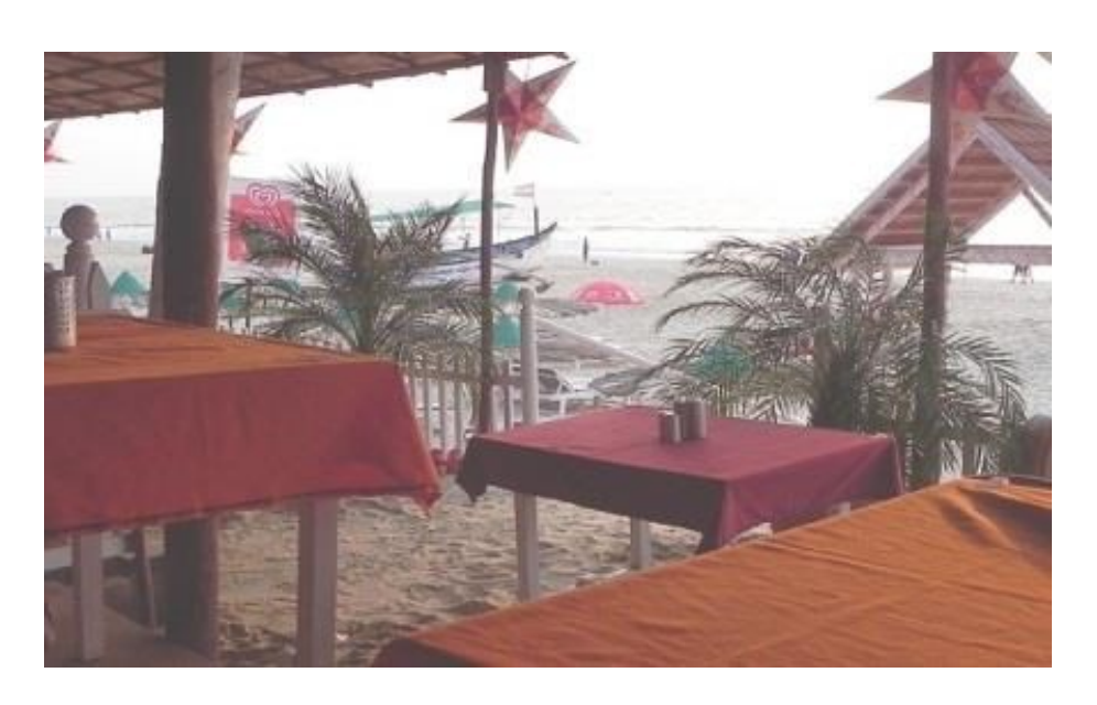
The Arabian Sea and the beach from Anthy's.