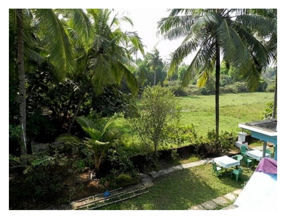
Our breakfast space at Villa Malibu next to a rice patty and a lot of palms.