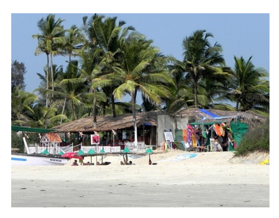
Anthy's, our hangout on the Arabian Sea.